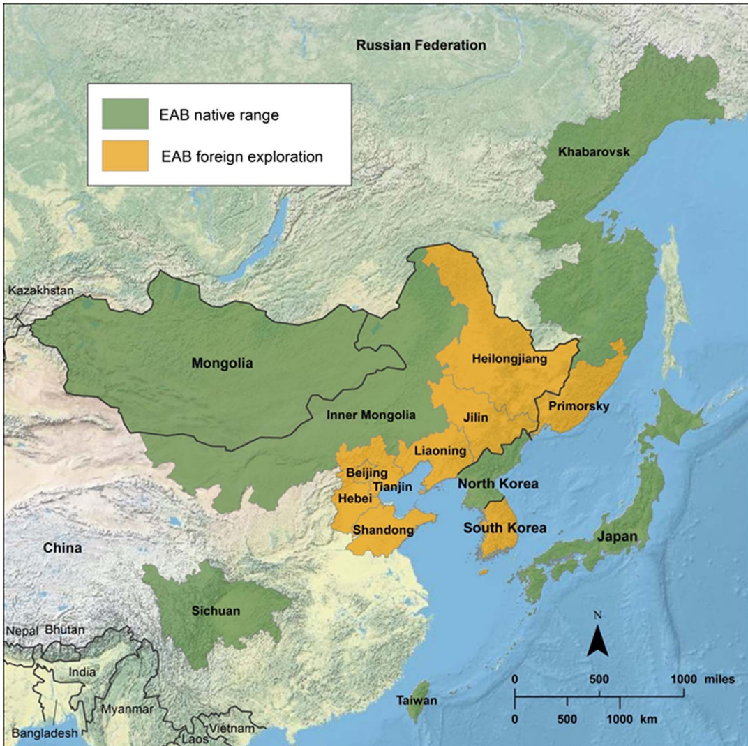
Fig. 2. Known native range of emerald ash borer, Agrilus planipennis , in Asia and other regions where foreign exploration for EAB natural enemies has occurred since 2003. Service layer credits: United States National Park Service. Data source: https://sites.google.com/site/eduardjendek/world-distribution-of-agrilus-planipennis . Map created by United States Department of Agriculture, Forest Service, Northeastern Area State and Private Forestry, Office of Knowledge Management (Durham, New Hampshire, United States of America).

(Hymenoptera: Braconidae) attacks EAB infesting North American F. velutina planted as plantation and landscape trees, with an average parasitism rates of 30–50% (Liu et al. 2003; Xu 2003; Yang et al. 2005) (Fig. 2). Also in Tianjin, a generalist parasitoid of woodborer larvae and pupae, Sclerodermus pupariae Yang and Yao (Hymenoptera: Bethyridae), parasitises up to 13% of EAB (Yang et al. 2012).